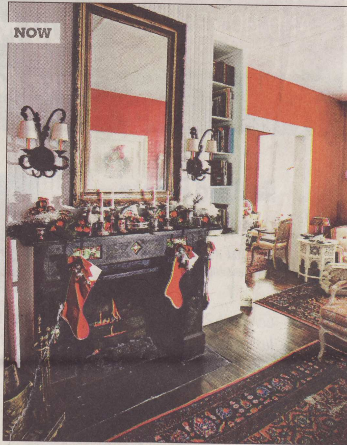
A vintage-slate fireplace and mantel suitable for inviting St. Nick.