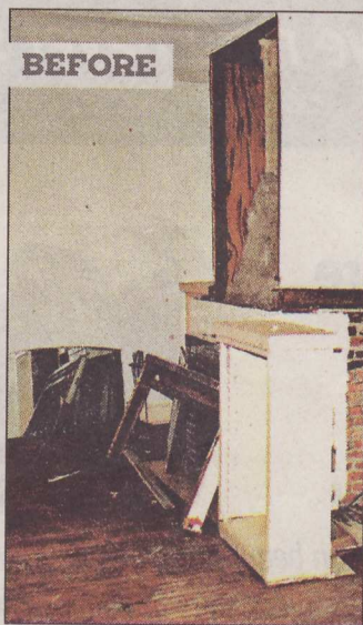
The Kimballs' fireplace renovation: In the beginning. BEAU KIMBALL